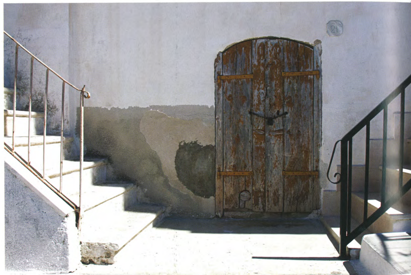
Mino Di Vita, Absences #01333, 70 x 100cm, lambda print on dubond, 2010