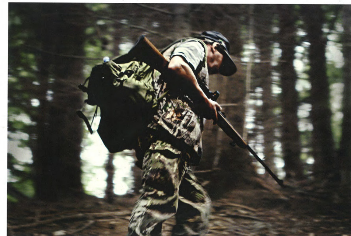
Ilaria Rupil, Il cacciatore (The hunter), 50 x 75cm, photo paper ilford perla, 2011