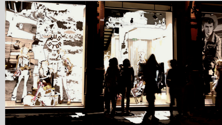
ROARING YEARS, 2011 | Hahnemule baryta paper, 70x39