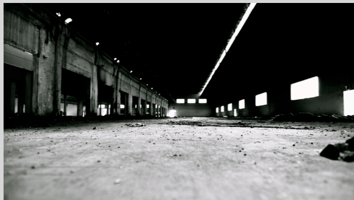
LA GIOIA DEL SILENZIO, 2010 | Hahnemule baryta paper, 70x50