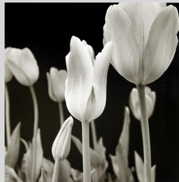
UNTITLED #2, 2008 | Gelatine silver fiber based paper, 40x30