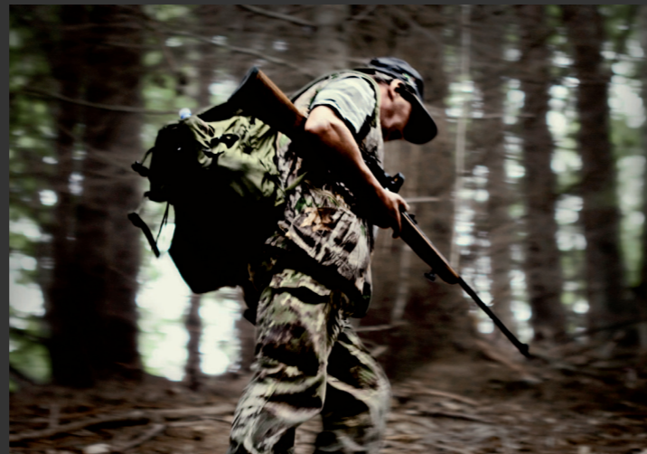
IL CACCIATORE, 2011 | Ilford Smooth Pearl paper, 75x50